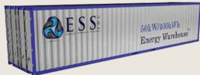
Each ESS Iron Flow Battery system is built in a 40' long by 9'6" high customized shipping container housing. Separate containers can be stacked to conserve space.