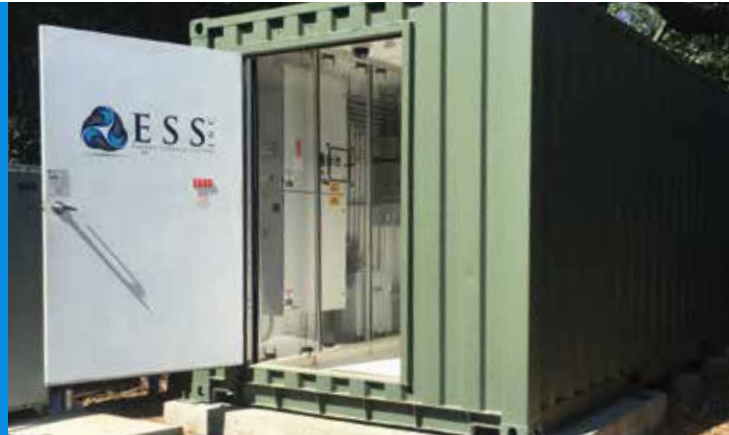
The IFB system installed within an advanced microgrid at Stone Edge Farm, Sonoma County, CA.