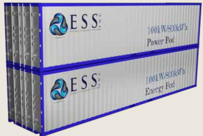
Each ESS Iron Flow Battery system is built in a 40' long by 8.5' high customized shipping container housing. Separate energy and power subsystems/containers can be stacked to conserve space