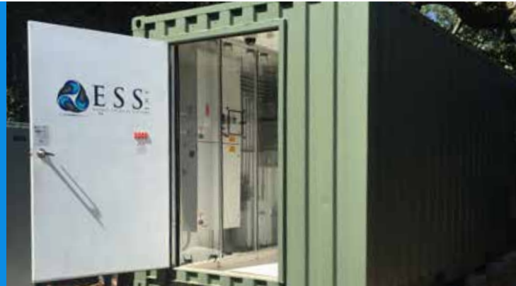
The IFB system installed within an advanced microgrid at Stone Edge Farm, Sonoma County, CA.